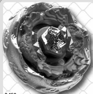
B-158 DEATH QUETZALCOATL™ 125SF BALANCE